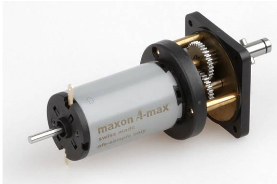
Top left: maxon A-max DC motor with spur gearhead