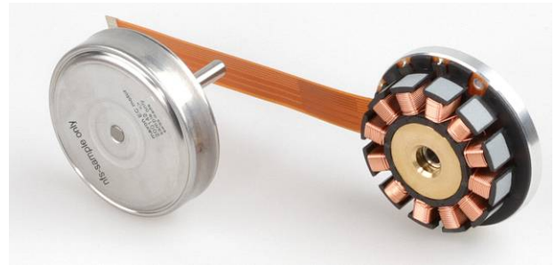
Top right: maxon EC 45 flat motor