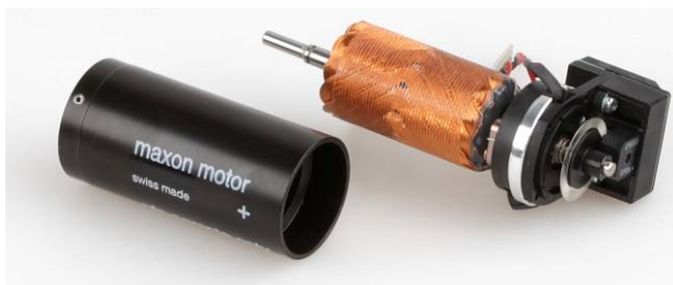
Bottom left: maxon RE 25 DC motor with optical encoder